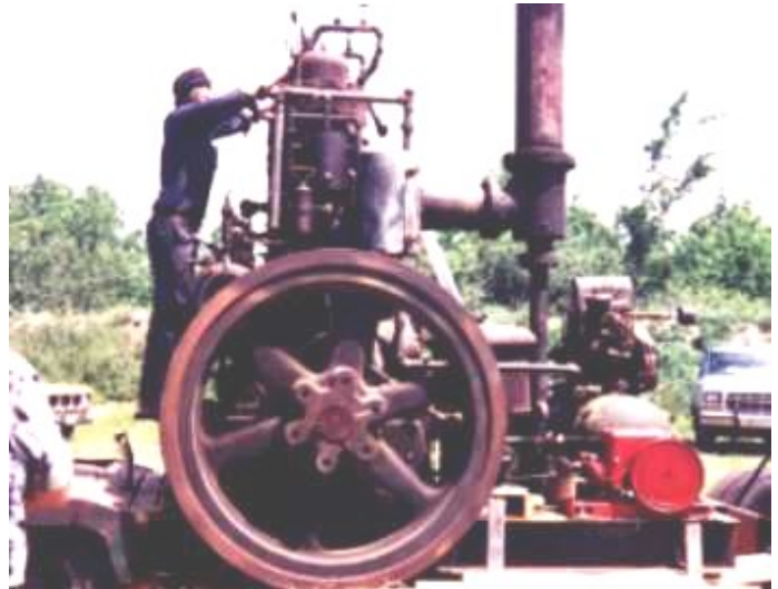
The Anderson diesel engine after it was donated in 1992. It will be on display at the Canton Show.

To get to the show site drive south out of Canton on Park Street (County Rt. 27). About 2 miles out turn right onto County Rt. 25. In about a half mile you will see Nickerson Rd. on the right. Follow it to the entrance to the Sportsman's Club grounds. See you there!