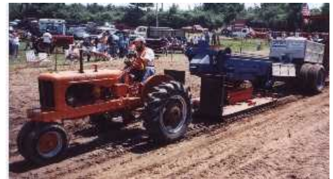
The antique tractor pull will be held on Sunday at the Canton Show. This event is open to tractors built in 1960 or older.