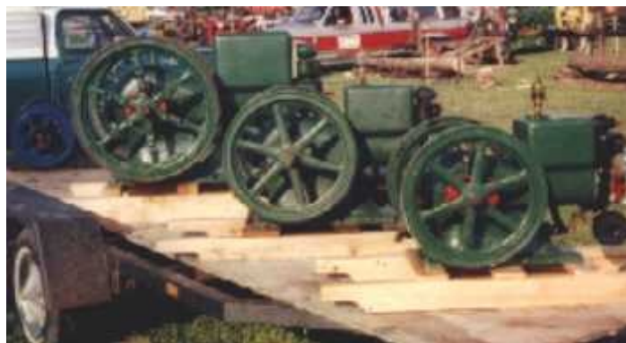
An International Harvester trio: (r to l) 1 1/2, 3, and 6 HP engines. They also made a 10.