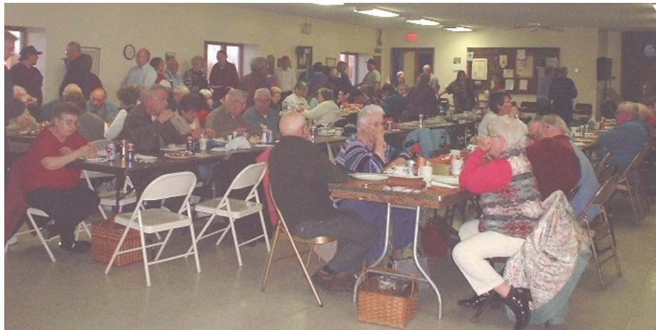
Some of the more than 100 members and spouses that enjoyed the Annual Banquet at the Louisville Community Hall in April. Banquet photos courtesy of Gary Hargrave.

With 20 days to process an application, will you have one? Try asking another vendor to support your concession. ☺