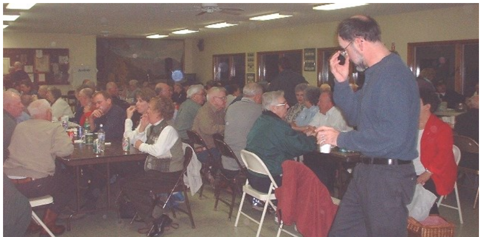
Association members and spouses at the Annual Banquet in April. Participation in this event has nearly doubled in the last three years.