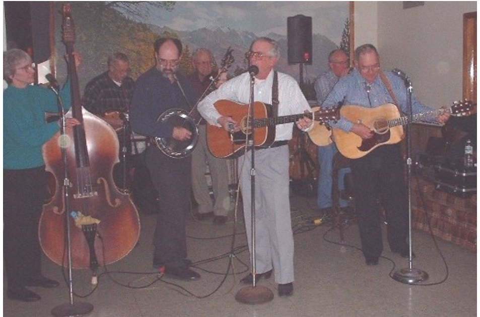
The Good Timers at the banquet. See story at left.

Over the years, performances by the Good Timers have become an important part of Association programs. We sincerely appreciate their many hours of fine music. We will see them again at the June show. ☺