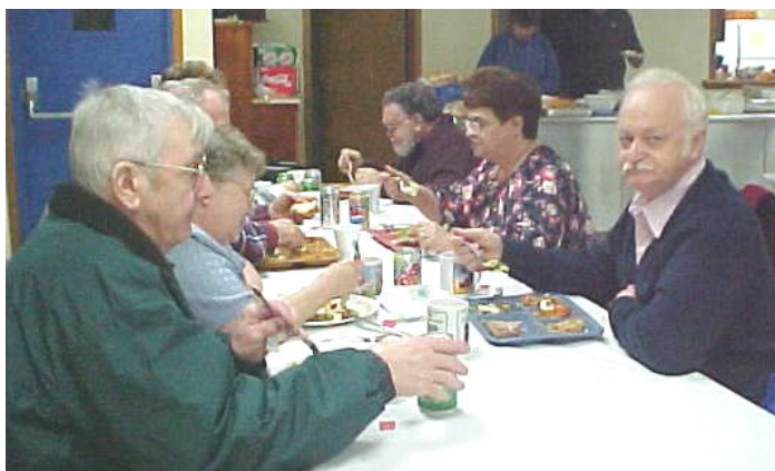
All pictures on this page are from the 2003 Annual Banquet held April 6 at the Louisville Community Center.