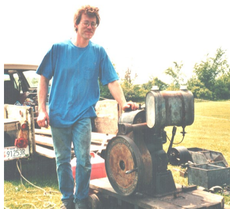
Old iron at its best on display at a June Show. Let's see yours at Louisville.