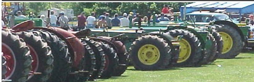
John Deeres line up to show off the green at the 2002 June Show in Canton.

Check the Web: http://home.twcny.rr.com/harg43/