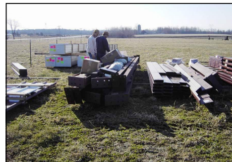
Checking to be sure every piece is there.