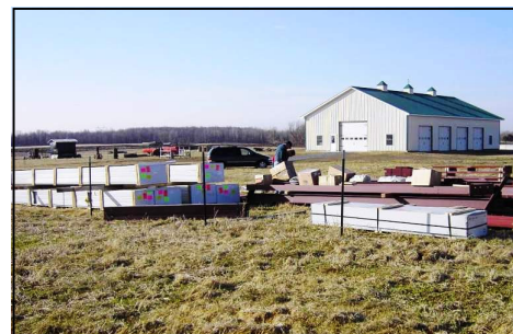
Steel for the Collection Building arrived and was off-loaded.