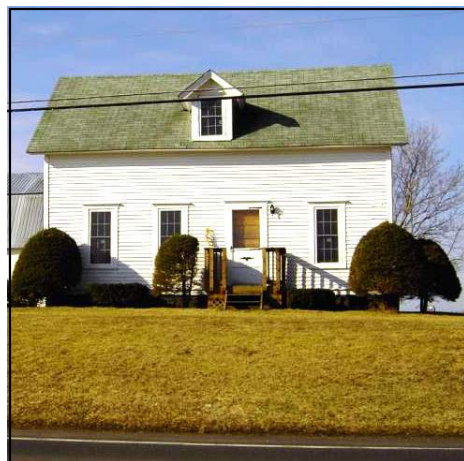
The Museum's Goolden-Mann farm house saw improvements during March.