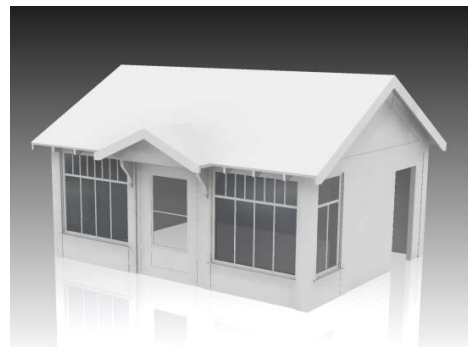
The Madrid gas station from initial drawings by Matthew Parno.

The Museum's Construction Committee will meet with AACA Section representatives during May to address specific details of the project including its location and materials. It is expected that the replica gas station will be a focal point for auto meets and related activities in the future. Several members of the AACA Section are also members of the Museum.