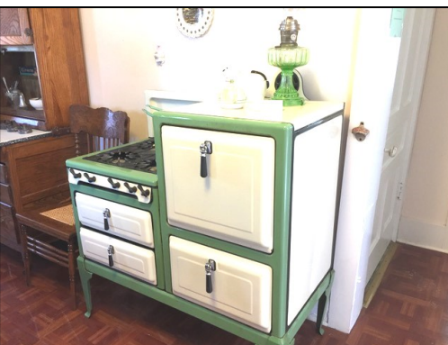
The beautiful gas kitchen range ca. 1928 donated by the Potsdam Museum.