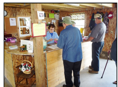
Raffle tickets will be on sale at the information desk inside the Pavilion during the Spring Exhibition. You can update your address and other information there too.