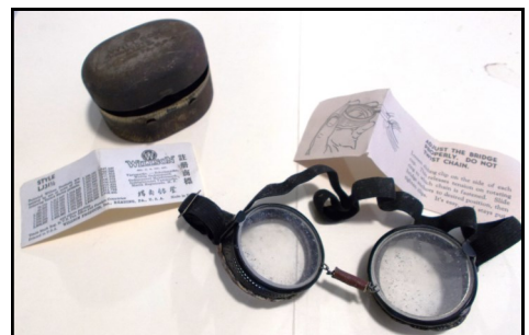
A set of early driving goggles for those enjoying the open road in an open car.