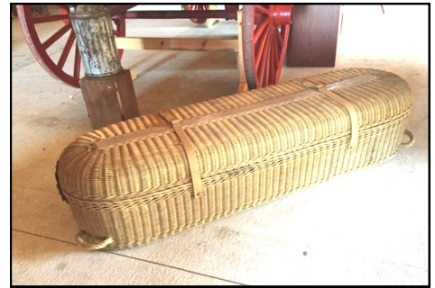
A beautiful basket for a sad occasion - carrying remains to the undertaker.