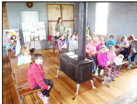
School will again be in session during the Spring Exhibition.