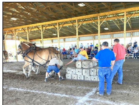
Horse pulls, Tractor Pulls, Garden Tractor Pulls and Pedal Tractor Pulls - the June Show will have something for every competitor. Not a puller? Try the Ladies Skillet Toss.

Please Note: It is certain that we have inadvertently left someone off this list or misreported numbers. Let us know of any errors or omissions, so we can correct them. Thanks.