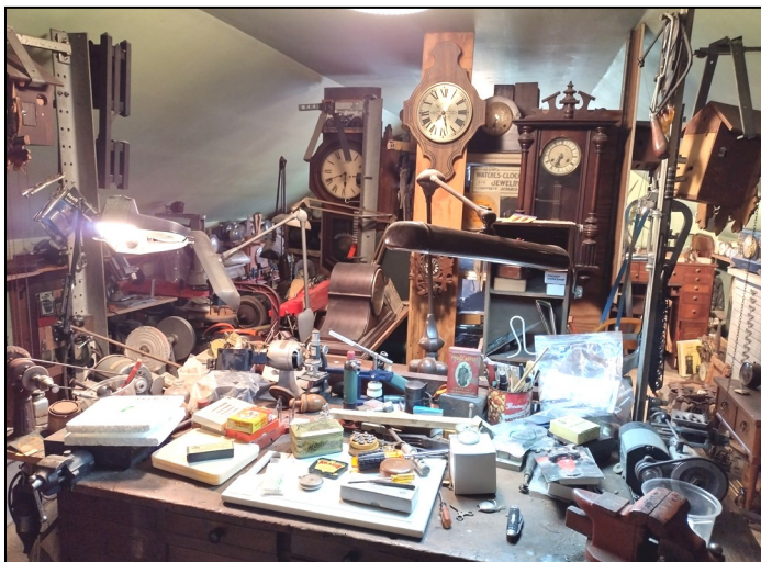
A portion of the original Hunter Clock & Watch Shop is currently located in the attic of the Hunter farmstead.