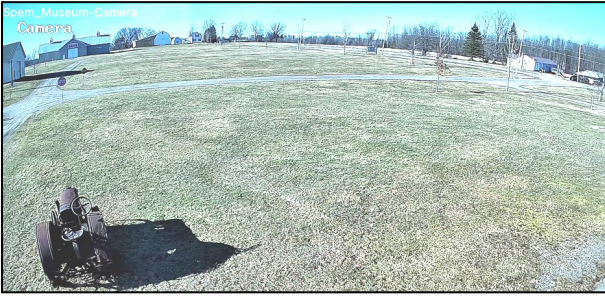
Same shot is seen on front page, taken in March 2024.