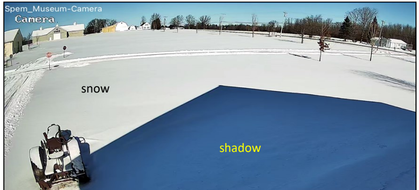
The Museum's security camera provides 24-hour surveillance, snow or shine. This photo was taken from one of the cameras in February 2024.

Being a volunteer is not a requirement for membership. But those who choose to do so keep the Museum running and growing. For most, it is very satisfying, great fun, an excellent way to keep the gray cells working without pills, and it can provide important exercise for the body. Working together has created great friendships for many, all the while getting important work done. Please check page 2 for a list of jobs that urgently need filling.