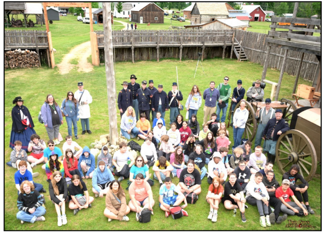
Norwood-Norfolk school students at Ft. Tribute.

spent a day at the Museum's Civil War Interpretive Center. They learned about St. Lawrence County's involvement in the Civil War. They toured Fort Tribute, the Schoolhouse, and concluded at the Log Cabin. The 70 students were hosted by Museum members of the 11th NY Light Artillery reenactment group that gave talks and demonstrations on the loading and firing of muskets and on how the traveling forge was used. The schoolmarm drilled the students on Civil War-related trivia questions. Channel 7 News covered the event. ★