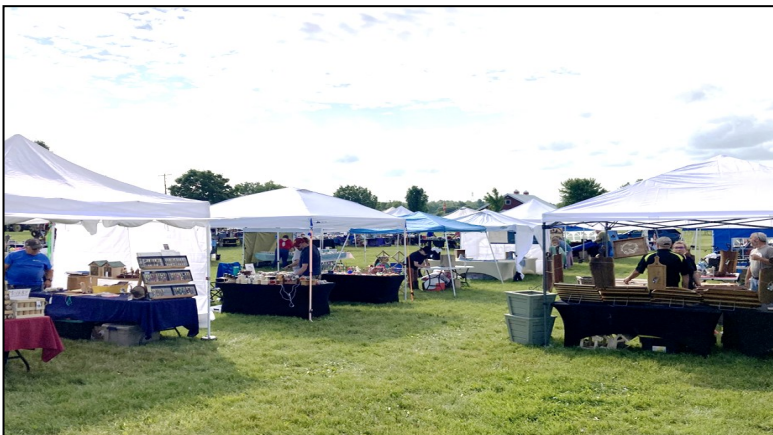
Fifty vendors offered a great selection for our visitors.