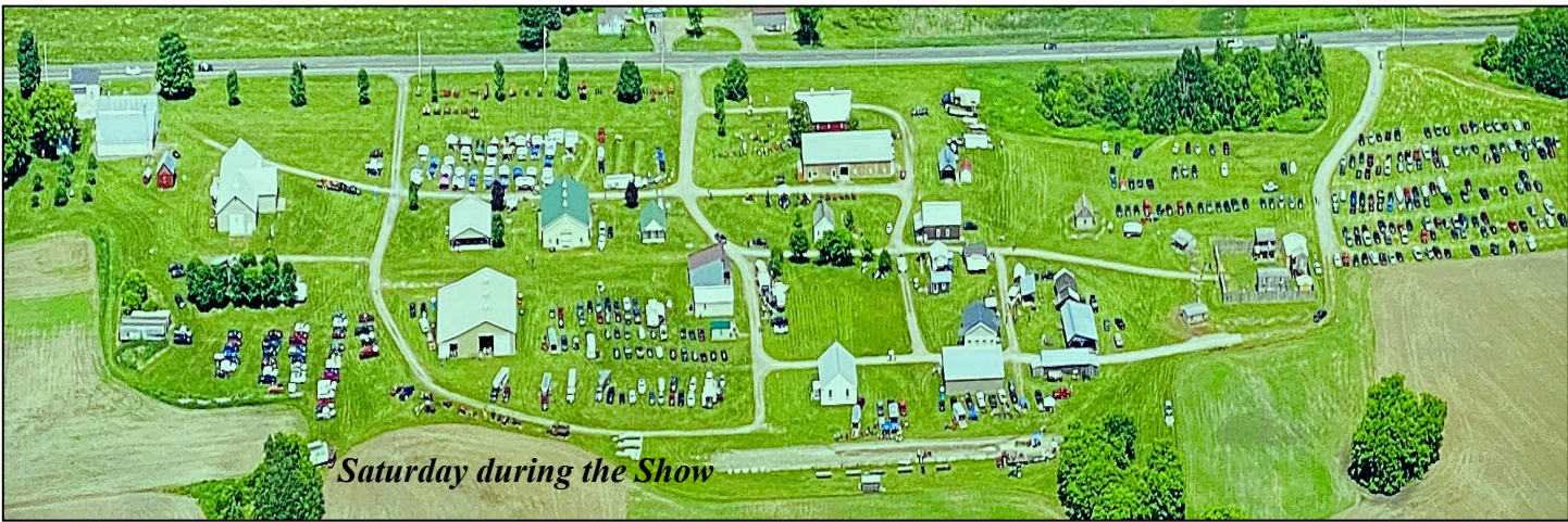
Saturday during the Show