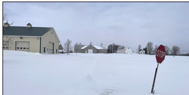
Cold winter days at the Museum.