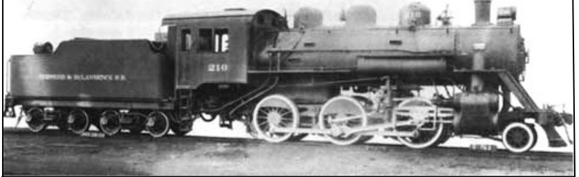
Original photo of the new 210 in 1923, courtesy of Norfolk Museum.

New friends at the NY State Bureau of Federal Property Assistance in Albany are checking new listings of federal surplus properties every day, looking for the historic Norwood & St. Lawrence Locomotive 210. They have spoken with our old friends at the Steamtown National Historic Site in Scranton where it now resides. Steamtown is completing paperwork needed to release the 210 to the Federal Surplus Property Program. Meanwhile, Albany has already sent in an application to acquire the 210 for us. The Museum's Railroad History Committee has been gathering historical records, conceptual building designs for a new Center, and volunteers to relocate the locomotive and install tracks when acquisition of the 210 is announced. Albany is excited and optimistic about returning the Historic 210 to its original home in the North Country, but it adds, "We can't make promises yet."