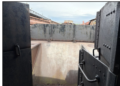
Not a very exciting photo, but behind the locomotive is the tender with its empty bin capable of holding 8 tons of coal. The top of the 5,000 gallon water tank can be seen in the rear. A strong back lad shovels coal to the locomotive's furnace while a pump moves water to its boiler.