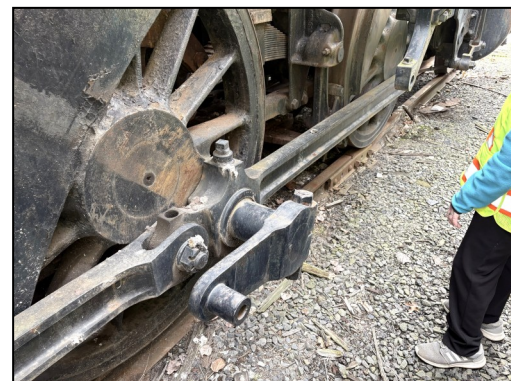
At 100 years old this year, locomotive 210 remains in remarkably good condition.