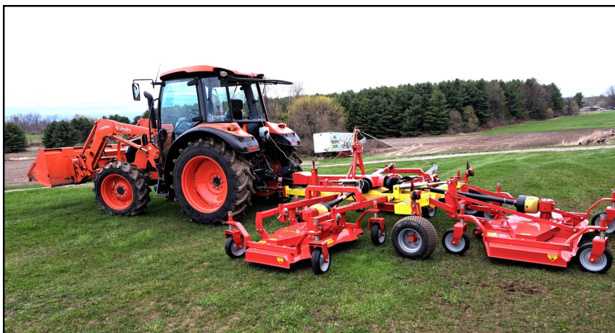
The Museum's new tractor and mower, just after their arrival. The mower will cut a 15-foot swath. The bucket on the front and its hydraulics are heavy duty.